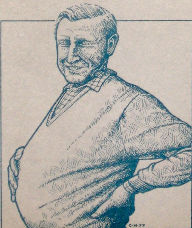
Benyon: Would he be so reactionary if it was him that got pregnant?