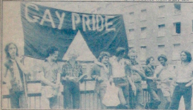
July 4. Picket outside Old Bailey during Gay News trial.