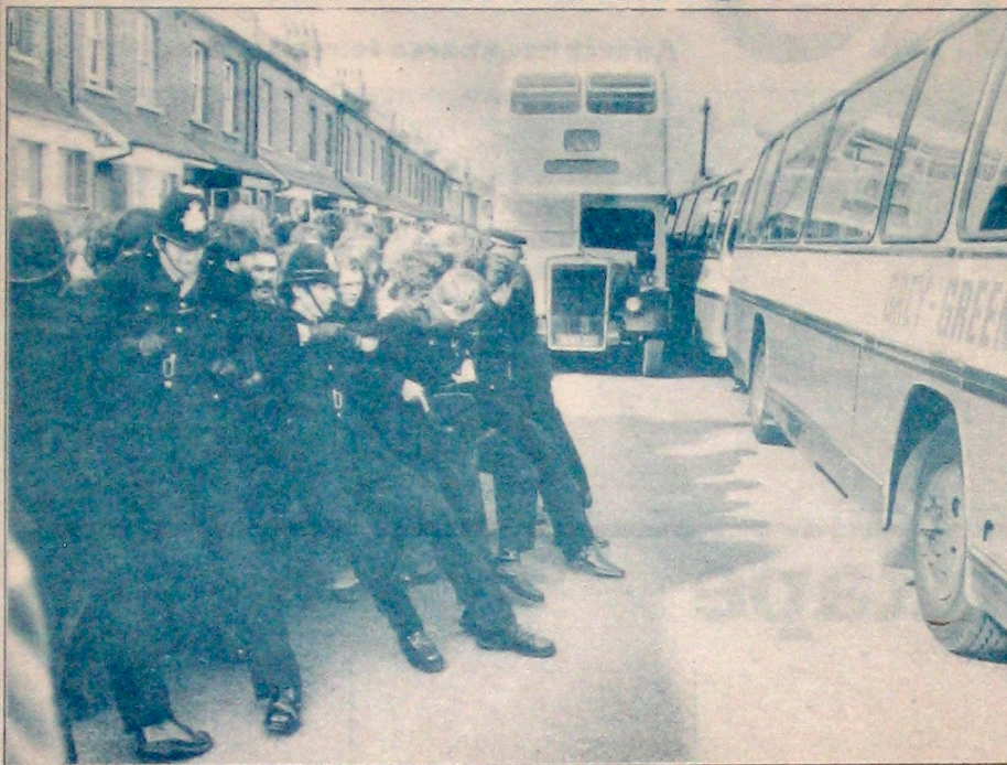
June 29, SPG clear the way for "bus of fear"

Grunwicks—just one non unionised back street sweat shop of the hundreds in North London and the East End which are living death to work in. The boredom and frustration, lack of solidarity, and the feeling of resignation nearly drive you insane, using mainly immigrant workers, continually harassed and insulted by supercilious racist supervisors and arrogant employers, overtime is compulsory and wages pathetic.