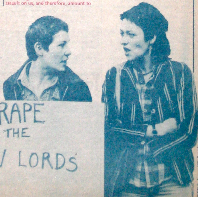
June 28. Women Against Rape picket the Law Courts

a prescription to rape. Why do we feel that rape and sexist images of women are essential radical feminist issues? Sexism is how male power operates against women; rape is the inevitable brutal expression of that power. All men are potential rapists, and therefore all women are potential rape victims. The reality of rape can affect all women—irrespective of age, race or class. Women are raped every day of their lives by the results of sexism and its agents—Capitalism, the family, religion, the media, education, psychiatry etc.—which negate our autonomy and individuality and deny our right to self definition and determination. Rape is the ultimate weapon which keeps us in our place. We must start to expose the Patriarchy's most blatant forms of intimidation by making an attack on rape! Rape Group, c/o 42 Earham Street, London WC2.